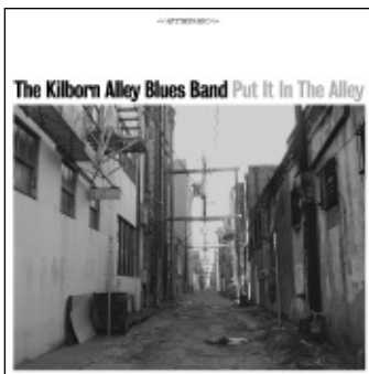
THE KILBORN ALLEY BLUES BAND Put It In The Alley (BB1007)